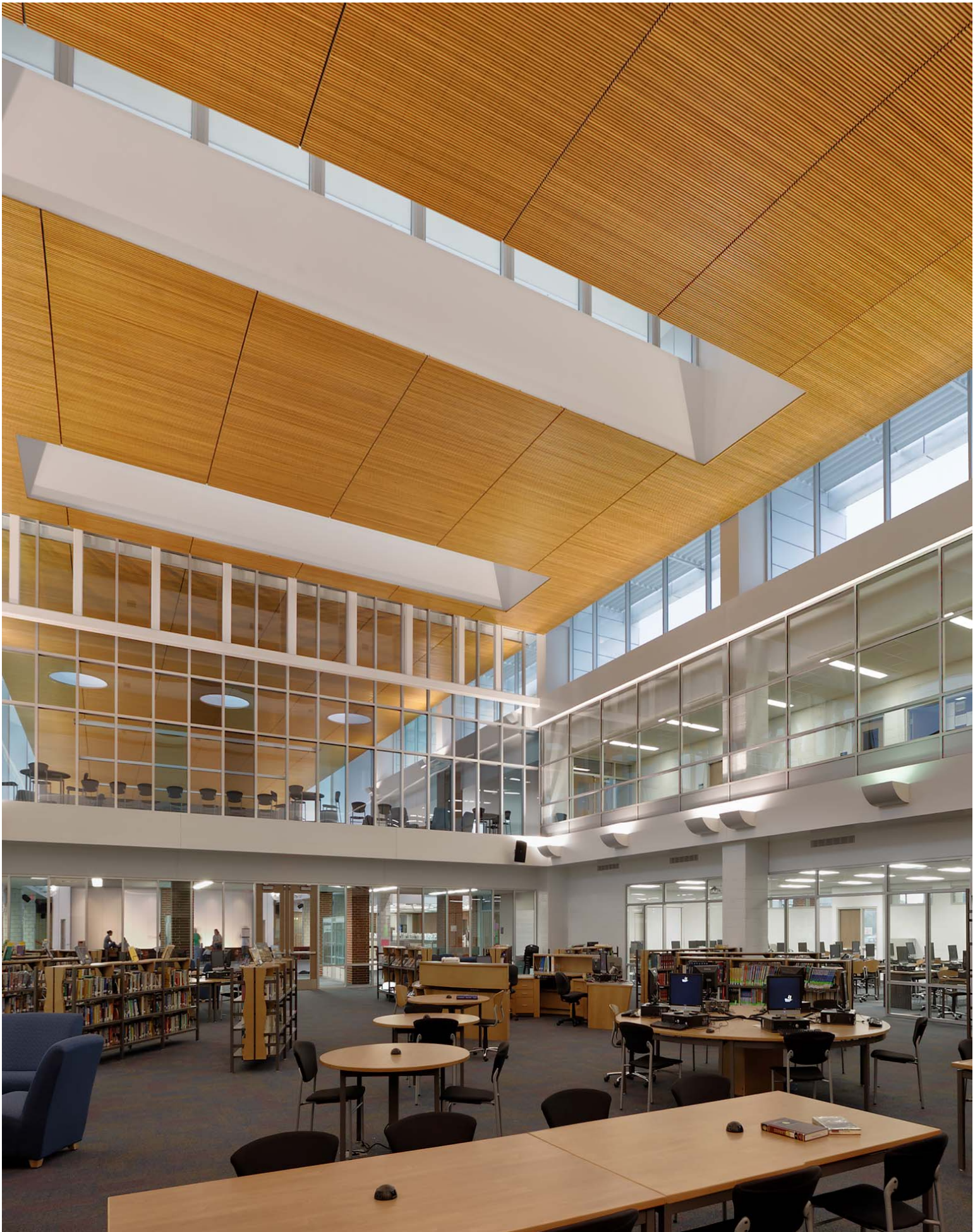
howell parker high school