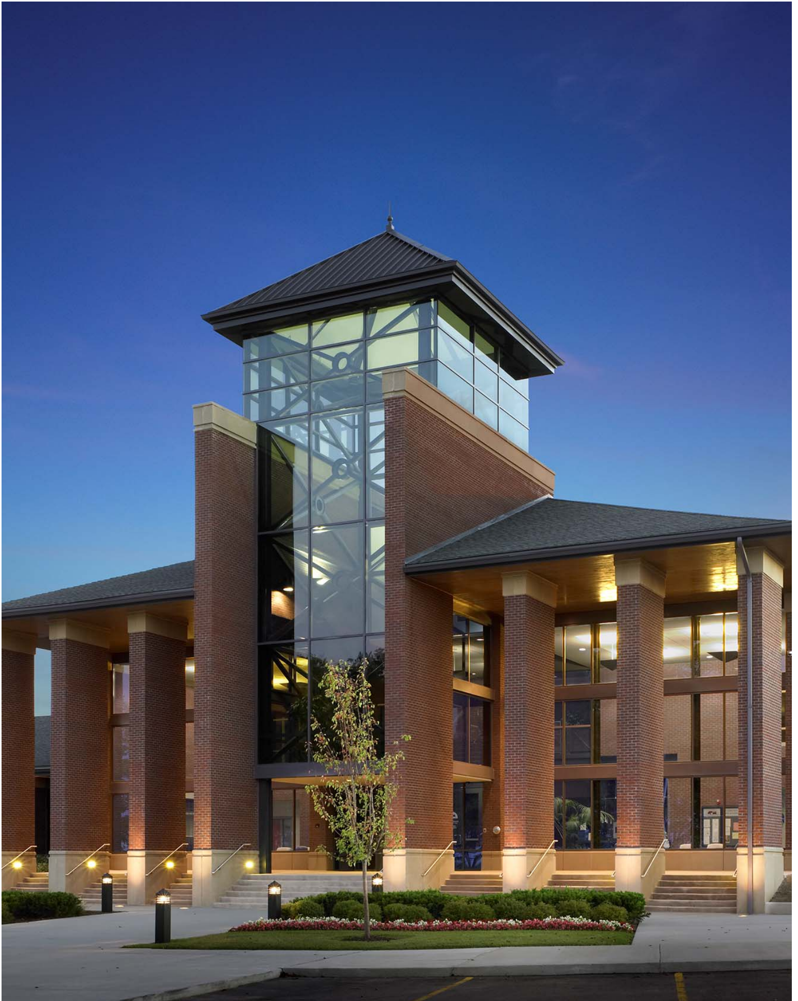
northville township municipal building