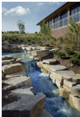
outdoor patio area