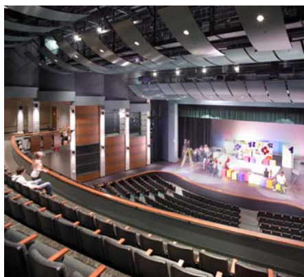
center for the arts stage