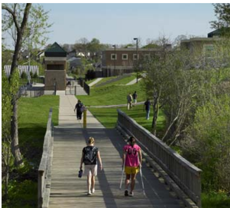
athletic field complex

Project features include a competition natatorium with diving pool, professional quality auditorium, media center, eight tennis courts, outdoor track, and lighted football/soccer stadium. A landscaped, timber walkway links the indoor athletic facility to the outdoor fields.