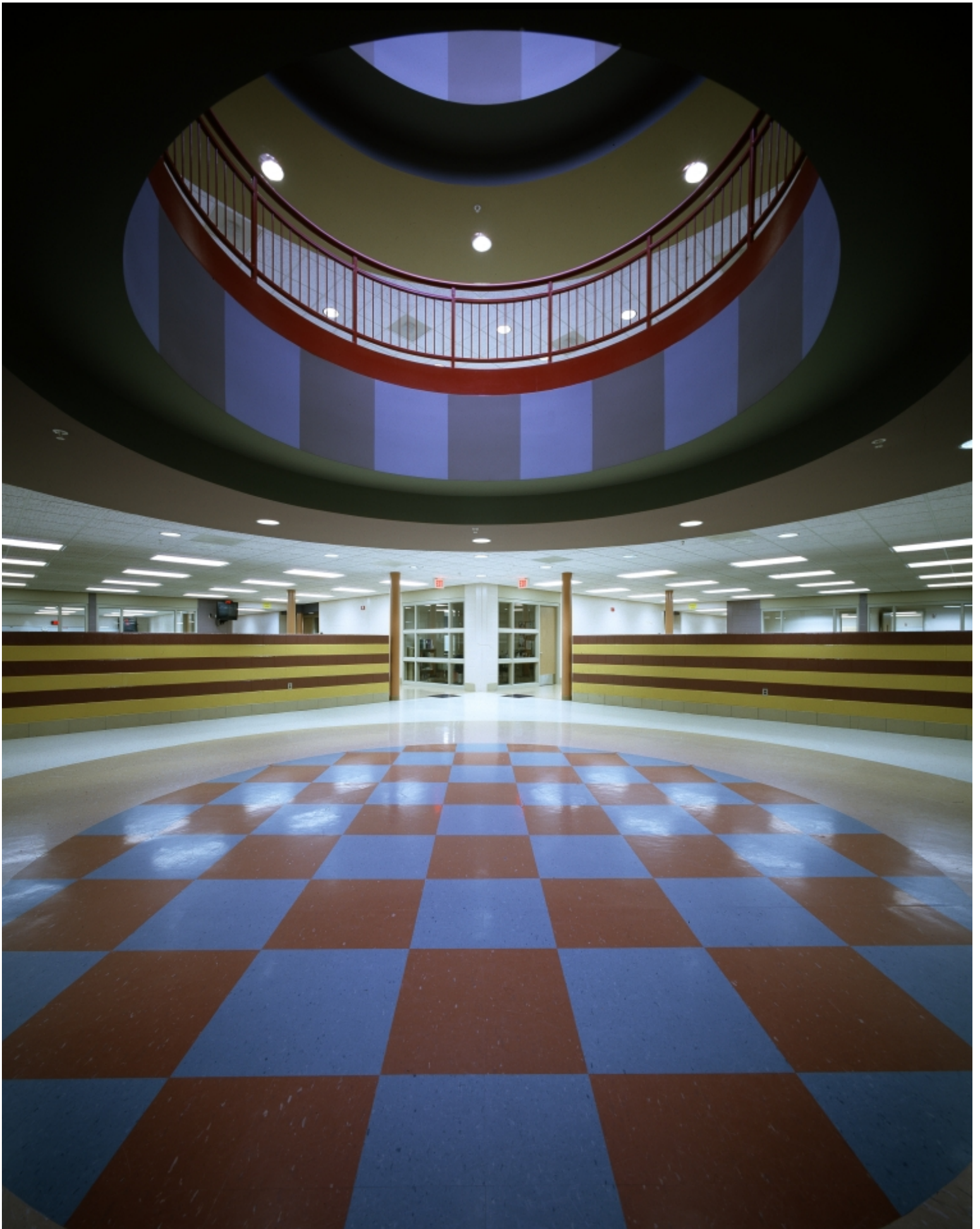
rochester stoney creek high school