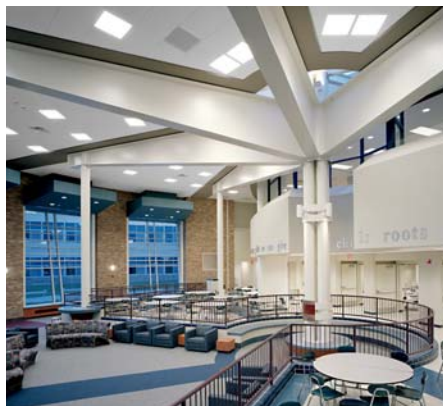
collaborative center addition