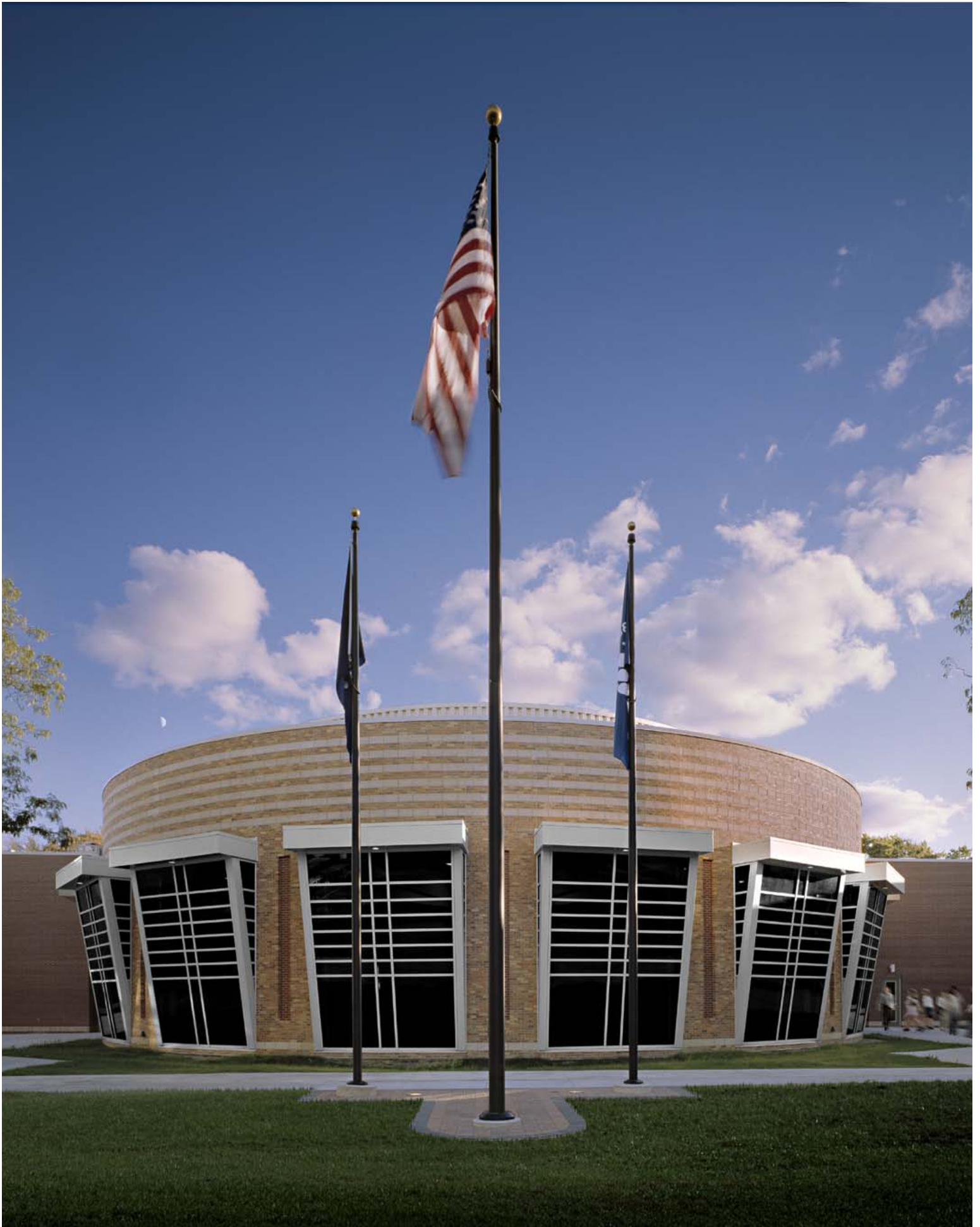
berkley high school