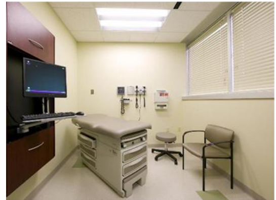
Wayne State University School of Medicine Suite