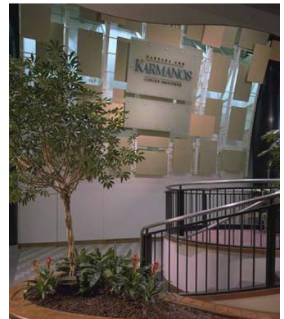
Karmanos Cancer Institute Family Atrium