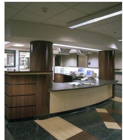
Port Huron Hospital LDRP