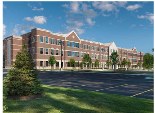
Shelby Macomb Medical Mall

Cardiac Cath Laboratory Cardiac Services Area - Phases 1 to 3 Hospital Lobby Renovation Mobile MRI Addition