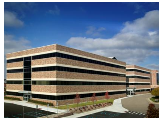
Crittenton Hospital Medical Office Building