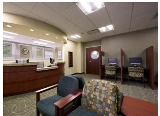
Wayne State University School of Medicine Suite